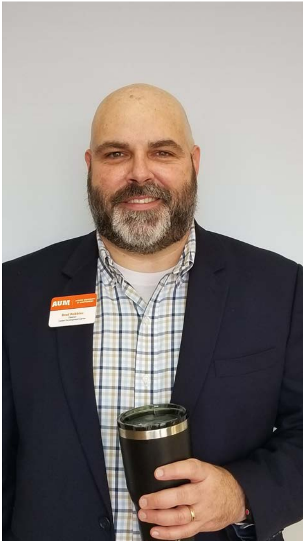
Uncropped image taken with a cell phone

Be sure to set your phone camera to take higher resolution photos for your headshot.