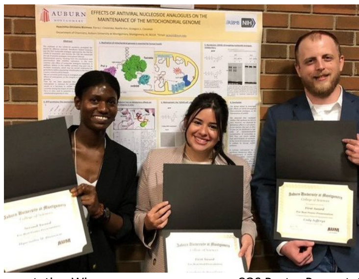
COS Oral Presentation Winners

Students of COS presented their research through oral and poster presentations. COS recognized several of its participants for their excellent work.