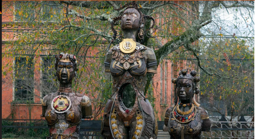
Anarcha Lucy Betsey Monument, the Mothers of Gynecology | Black Lives Matter Mural