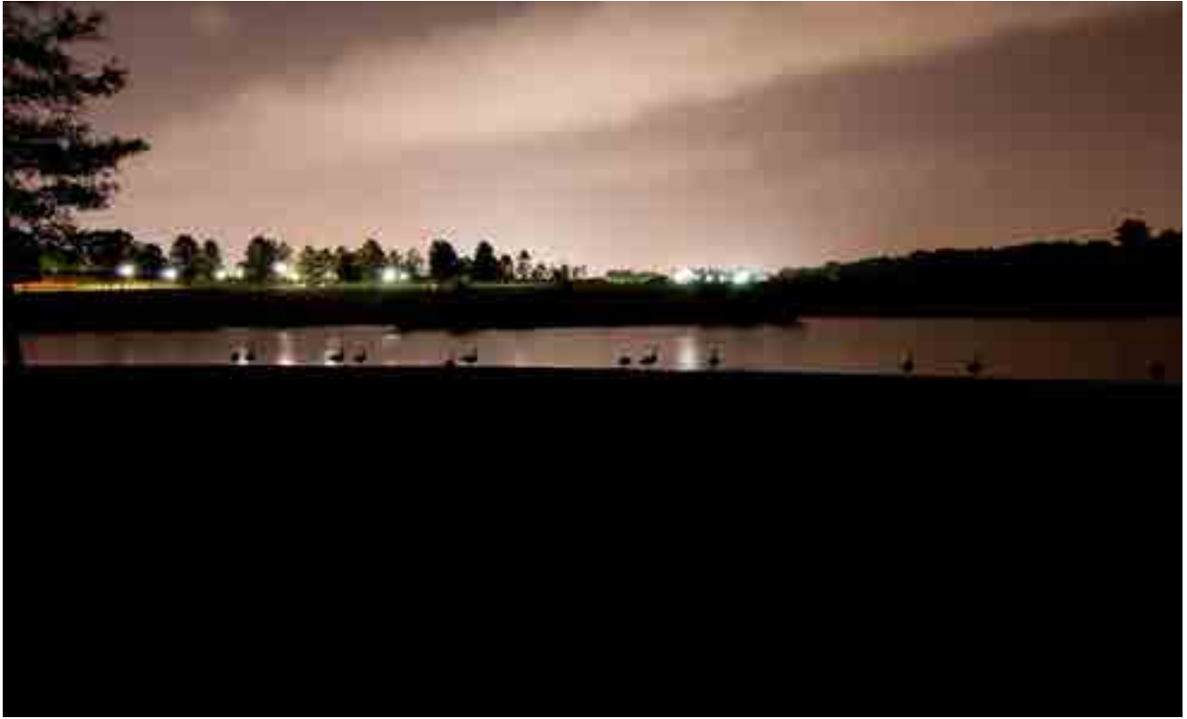
A STILL AND QUIET CONSCIENCE | Jennifer Johnston