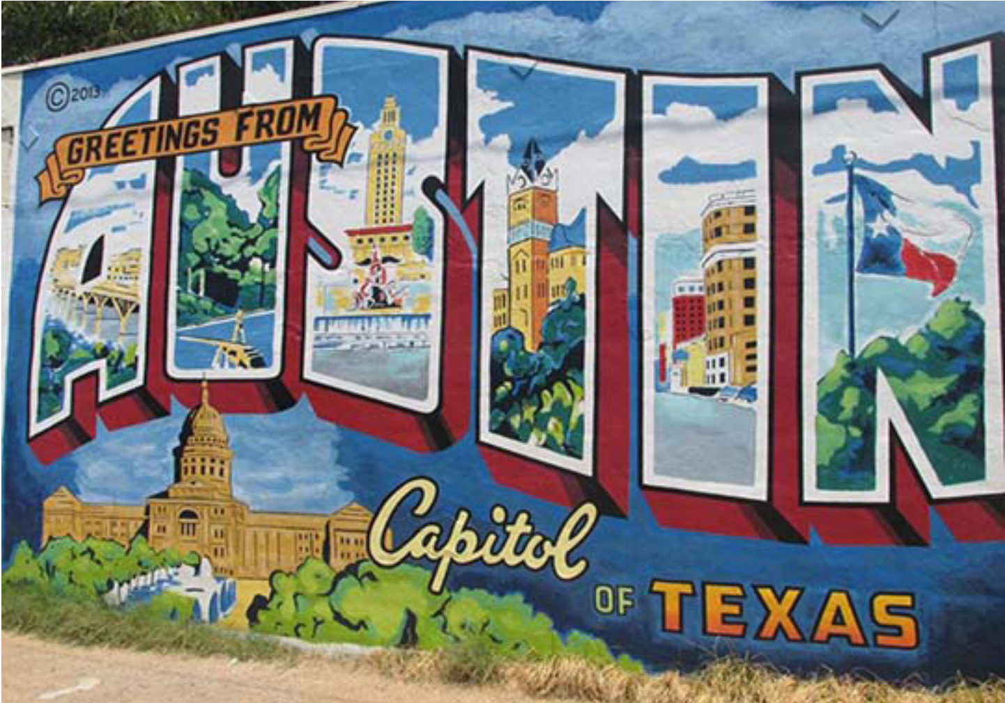
AUSTIN GRAFFITI PARK | Meredith Foresee