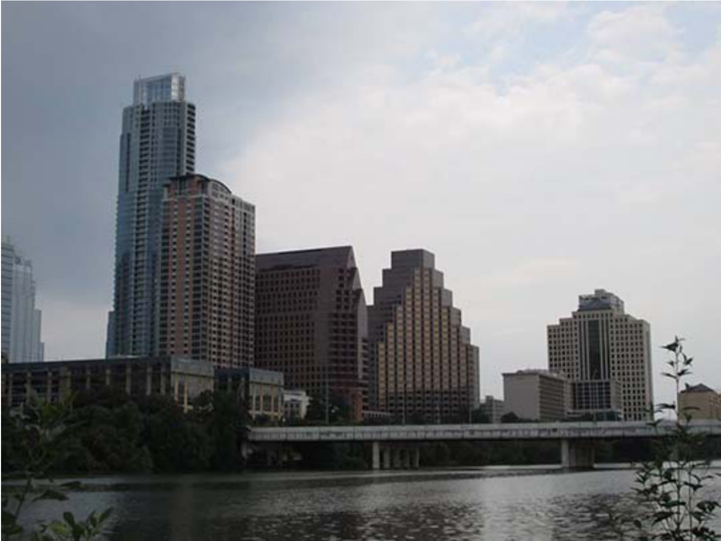
AUSTIN CITY SKYLINE