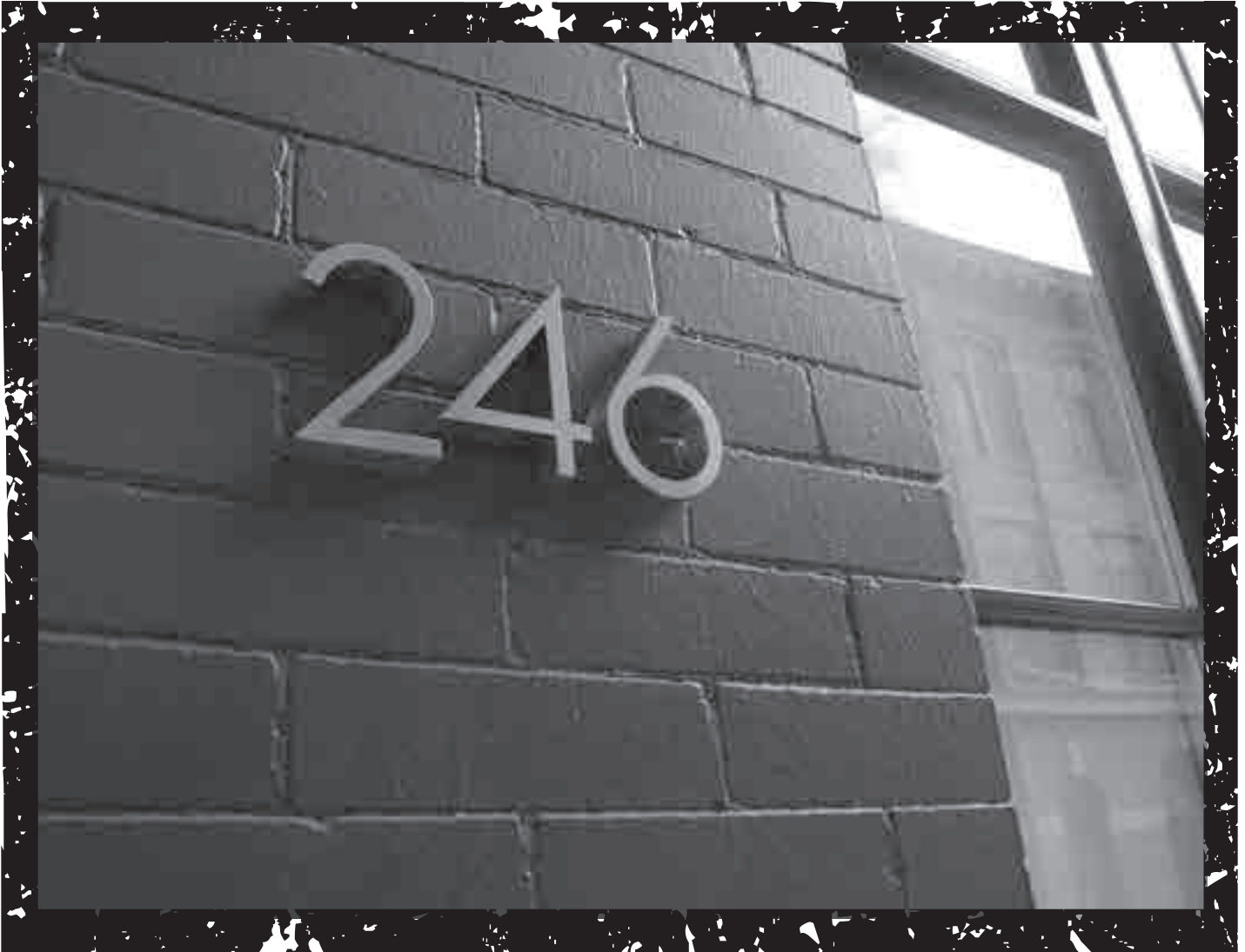
Can I Have Your Number? * Naomi Stauffer