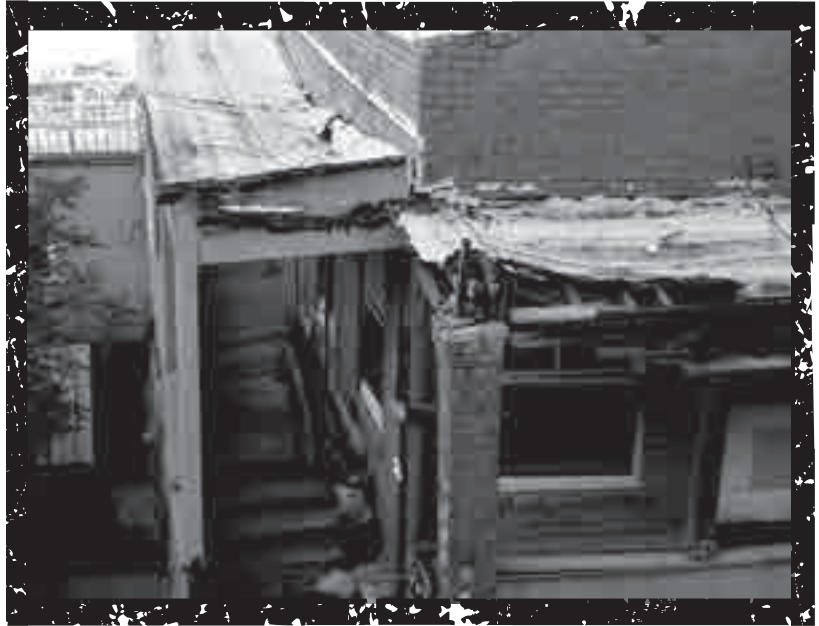
Catching Rain * Marisa Temple