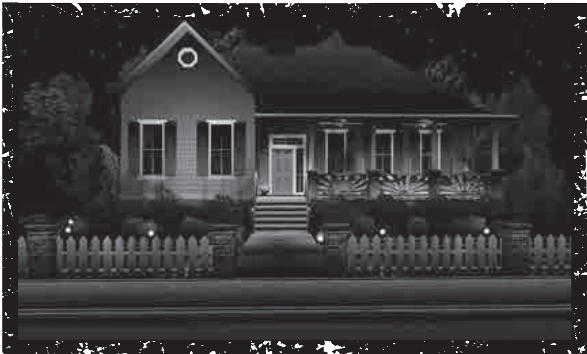
Trick or Treat - Model Rendering * Thomas Austin