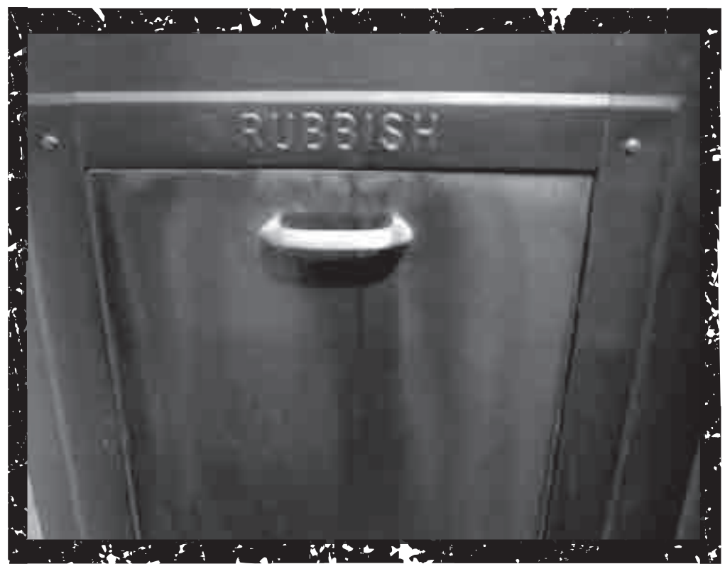
Utter Garbage * Marisa Temple